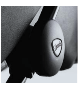
Adjust the Stressless® Glide wheels to the setting of your desire. You can automatically shift to any seating position simply by using your body weight.