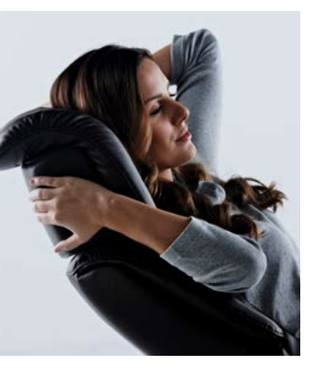
Lower the headrest to the sleep position with one simple movement.