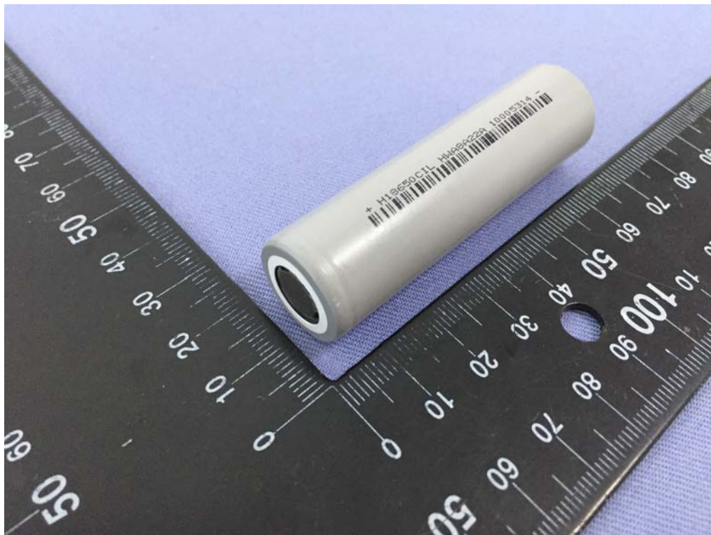
Figure 4 Overall view of cell (外观图)