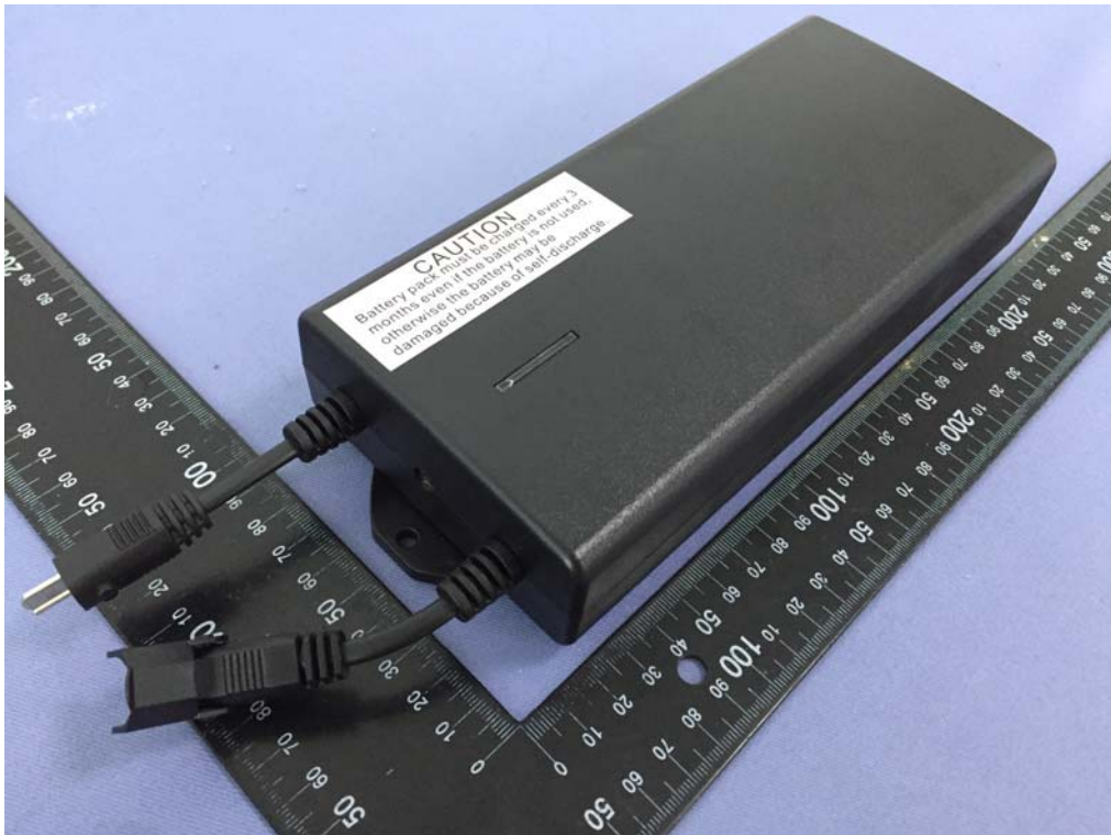
Figure 2 Overall view of battery (外观图)